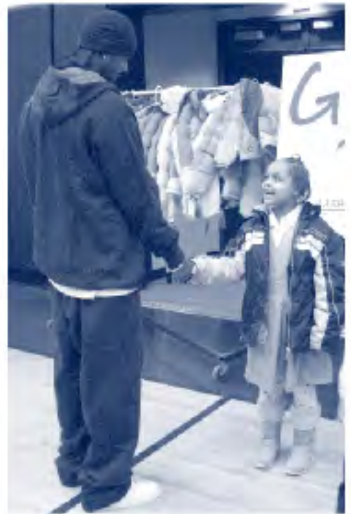
A star-struck recipient thanks Larry Hughes for her new coat.

The remaining coats were distributed to children in need through Shoes and Clothes for Kids' forty distribution partner sites. Shoes and Clothes for Kids would like to extend special thanks to Larry Hughes and his foundation and to the Cavaliers Community Service Department for coordinating this event that put a smile on so many of Cleveland's children.