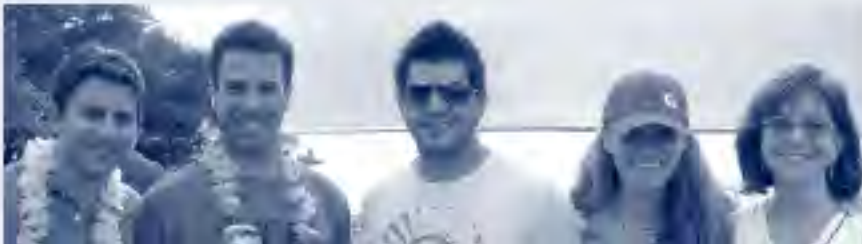
Luau attendees enjoy the party and the view

Sponsorship opportunities available. For more information about Luau on the Lake, contact Shoes and Clothes for Kids at 216.881.7463 x. 4 or smcguire@sc4k.org .