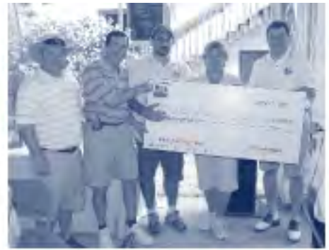
ARAMARK presents Shoes and Clothes for Kids with a check from the Golf Classic.