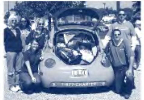
The Charter One Beetle was packed full of school supplies and the employees helped sort the donation.

If you are interested in hosting a collection drive next year to support Stuff the Bus, contact our Development Department at 216-881-7463 ext. 4.