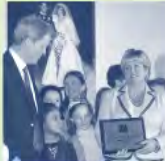
Charles, 9th Earl Spencer receives a special plaque during his Ohio visit.