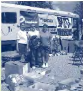
Forest City Enterprises donates boxfuls of school and office supplies.

The awareness and donations raised by the Huntington Back-to-School Campaign had a significant impact upon Kids' programs and services.