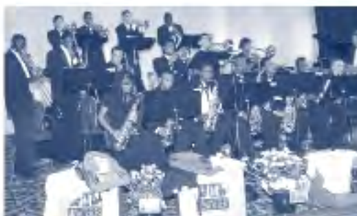
The Early College Band entertains guests at the Heart and Sole Luncheon.