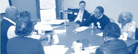
Distribution Partners and Board Members participate in Strategic Planning session

SC4K has a long standing partnership with the Cleveland Browns. The Cleveland Browns have been the title sponsor of SC4K's back-to-school campaign for the past three years.